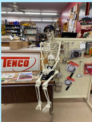
Chillin with by BFF, Achmed!