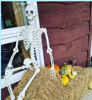
I'm sexy and I know it!