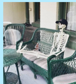
Everyone deserves a little break!